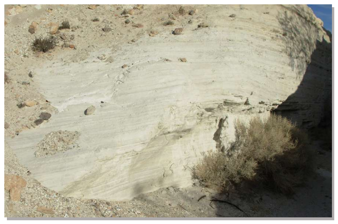
Example: Typical raw material deposits at source within the Riverside MSA, California.

The Riverside MSA comprises a major rail hub in Barstow. This EPD assumes source material located in the Riverside MSA and a 20-mile round trip from mining source to the facility. There are several candidate sources that could fulfil this descriptor. Hence, for A2 purposes, the impact of such variations are likely trivial. In common across all candidates, the raw material is typically loose and of zero to minor applomeration, of size 0-60mm (75% >1mm). Typical chemical composition is as follows (all values in %), to account for 99.95% by mass: