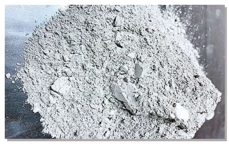
EMC Volcanics: An EMC made from volcanic material (Luleå, Sweden, 2020).

Product name: EMC Volcanics (tradename: CemPozz-NP).