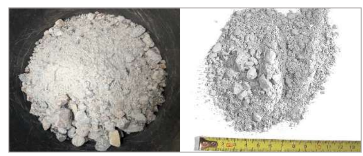
Detail: Loose Californian raw material. Fully-processed EMC Volcanics, ready-to-use.

The EMC process does not cause any chemical reaction. Hence, a raw material's nascent chemical-composition remains unchanged.